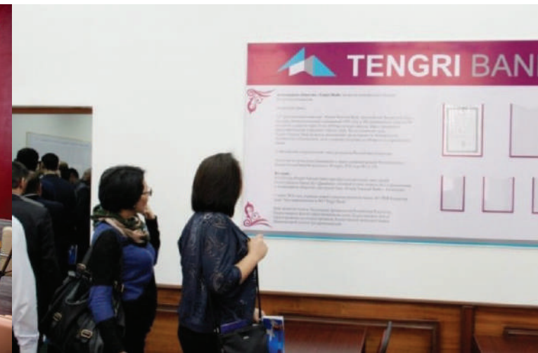
TENGRI BANK Room