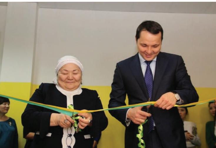
Lecture hall from sponsors of Business School