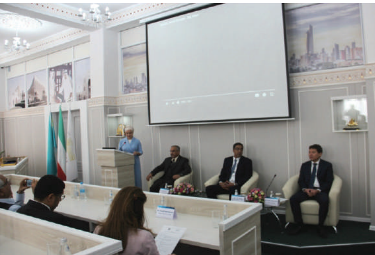
Lecture hall of the State of Kuwait

It is important to mention the experience of KAZGUU and the Endowment Fund in raising funds from companies and individual sponsors to improve material and technical infrastructure. Currently, KAZGUU has 11 lecture rooms with MORE THAN 70 MILLION TENGE.