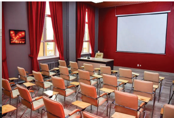
KASSA NOVA Bank Room