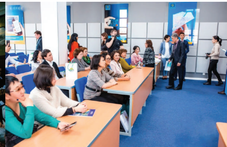
QAZKOM BANK Room